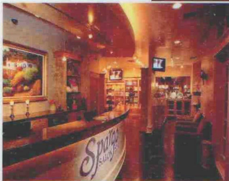
CLOCKWISE, FROM TOP: At Spargo Salon & Spa, the spa is on the first floor and the salon is located above; the cozy reception and retail area sets a warm, relaxing tone; a wall of water separates the shampoo bowls and styling stations; Spargo's signature spa room offers a sensual experience for two.

Spargo was so successful in its first five years that Saloga was forced to build a new location last year, expanding from 2,400 square feet to almost 8,000, at an estimated cost of $2.5 million. The design and décor were inspired by Saloga's many trips to Pompeii and Rome and modeled after ancient Roman bathhouses. Several Roman artifacts and antiquities complement the Old World Mediterranean design. "The salon on the upper level reflects an open, forum-like space, like